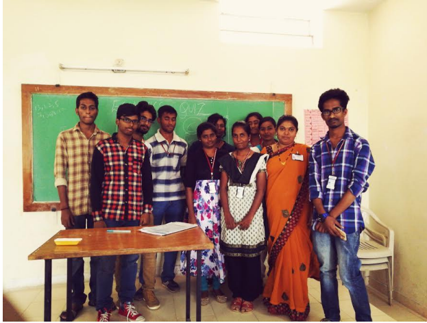
The Winning Team

Conducted a quiz in topics of market structures and national income